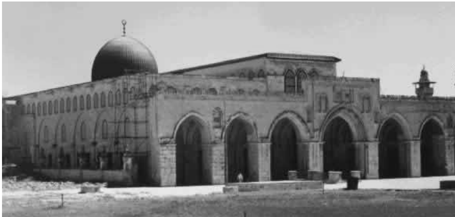
Masjidul Aqsa, Jerusalem

In Madina, the Jews also said their prayers facing Baytul Muqaddas. They did not like the fact that the Muslims had the same Qiblah as they did, and tried to use this fact to discredit Islam and the Holy Prophet (S). They said to the Muslims, "Muhammad claims to have a religion whose laws supersede all other previous laws, yet he does not have an independent Qiblah, and offers his prayers facing the Qiblah of the Jews."