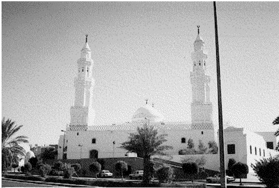
Masjide Dhul Qiblatayn – Madina

The mosque where this happened is known as "Masjide Dhul Qiblatayn" which means "The Mosque with the Two Qiblahs". This mosque still exists in Madina and the old and new Qiblahs can still be seen there today.